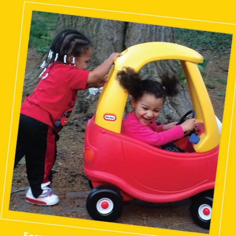
Former and current foster children: Little Man and Little Miss on a play date.